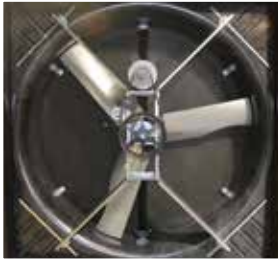
Rigid x-wing motor mount design and reinforced corner bracing