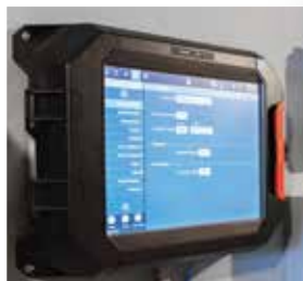
Pair your Commander fans with an EDGE® controller for complete system management and remote access capability.