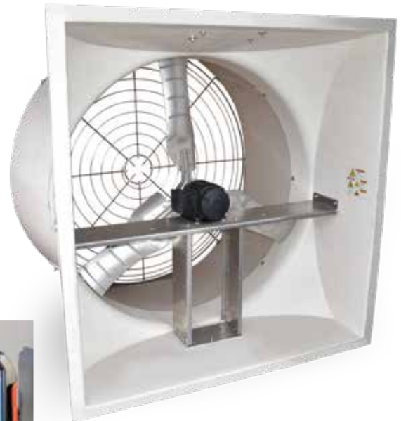
CORROSION RESISTANT ALUMINUM MOTOR MOUNTS, STAINLESS STEEL HARDWARE AND PROPS.