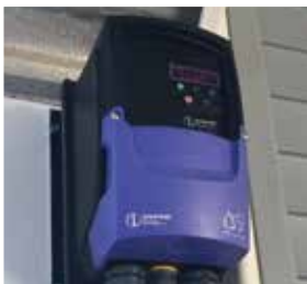
The Optidrive™ provides precise motor control and energy savings using the custom programs for each Commander fan.