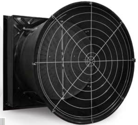
NON-CORROSIVE COMPOSITE CONE AVAILABLE.