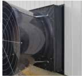
Flush mount design allows retrofit over wall openings from 57.5" to 63"