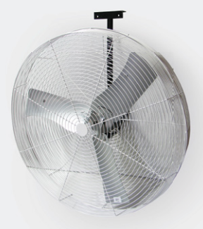
3-Bladed Circulation Fans