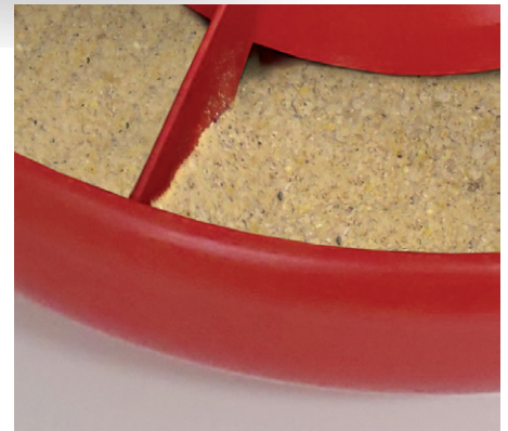
An enhanced pan feed-saver lip helps keep feed in the pan and off the floor.